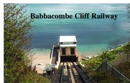
Babbacombe Cliff Railway

TLH LEISURE RESORT IS BEAUTIFULLY SITUATED FOR EASY ACCESS TO THE MANY DELIGHTS OF THE ENGLISH RIVIERA AND SOUTH-WESTERN DEVON. Besides many exciting resorts – Paignton, Brixham, Babbacombe, Dartmouth, Salcombe with its atmospheric yachting centre, Burgh Island where at high tide a tractor carries visitors to the island plus Plymouth with its famous history and outstanding attractions. Moving inland Buckfastleigh and Kent's Cavern will appeal whilst Dartmoor one of our outstanding National Parks demands a visit. The picturesque old English village of Cockington with its thatched cottages and 460 acres of beautiful country park – plus of course a traditional Devon Cream Tea!