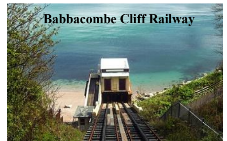
Babbacombe Cliff Railway

TLH LEISURE RESORT IS BEAUTIFULLY SITUATED FOR EASY ACCESS TO THE MANY DELIGHTS OF THE ENGLISH RIVIERA AND SOUTH-WESTERN DEVON. Besides many exciting resorts – Paignton, Brixham, Babbacombe, Dartmouth, Salcombe with its atmospheric yachting centre, Burgh Island where at high tide a tractor carries visitors to the island plus Plymouth with its famous history and outstanding attractions. Moving inland Buckfastleigh and Kent's Cavern will appeal whilst Dartmoor one of our outstanding National Parks demands a visit. The picturesque old English village of Cockington with its thatched cottages and 460 acres of beautiful country park – plus of course a traditional Devon Cream Tea!