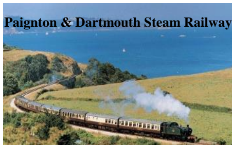
Paignton & Dartmouth Steam Railway