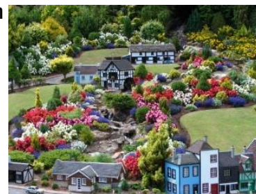
Babbacombe Model Village

8.00 - 9.45am Enjoy a leisurely breakfast before your journey home