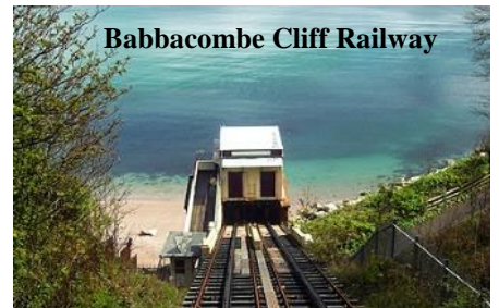
Babbacombe Cliff Railway

TLH LEISURE RESORT IS BEAUTIFULLY SITUATED FOR EASY ACCESS TO THE MANY DELIGHTS OF THE ENGLISH RIVIERA AND SOUTH-WESTERN DEVON. Besides many exciting resorts – Paignton, Brixham, Babbacombe, Dartmouth, Salcombe with its atmospheric yachting centre, Burgh Island where at high tide a tractor carries visitors to the island plus Plymouth with its famous history and outstanding attractions. Moving inland Buckfastleigh and Kent's Cavern will appeal whilst Dartmoor one of our outstanding National Parks demands a visit. The picturesque old English village of Cockington with its thatched cottages and 460 acres of beautiful country park – plus of course a traditional Devon Cream Tea!