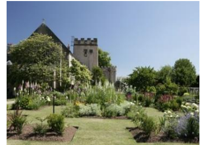
Torre Abbey Gardens

8.00 – 9.45am Breakfast is served in the restaurant 10.15 – 11.45am Learn & Improve sessions for all 2.30 – 4pm Enjoyable afternoon Tea Dance 6.00pm Dinner is served in the Restaurant 8.15 – 8.45pm Dance revision in the Ballroom 8.45 – 11pm Music & Dancing