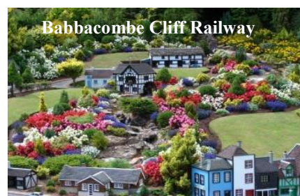
Babbacombe Cliff Railway

TLH LEISURE RESORT IS BEAUTIFULLY SITUATED FOR EASY ACCESS TO THE MANY DELIGHTS OF THE ENGLISH RIVIERA AND SOUTH-WESTERN DEVON. Besides many exciting resorts – Paignton, Brixham, Babbacombe, Dartmouth, Salcombe with its atmospheric yachting centre, Burgh Island where at high tide a tractor carries visitors to the island plus Plymouth with its famous history and outstanding attractions. Moving inland Buckfastleigh and Kent's Cavern will appeal whilst Dartmoor one of our outstanding National Parks demands a visit. The picturesque old English village of Cockington with its thatched cottages and 460 acres of beautiful country park – plus of course a traditional Devon Cream Tea!