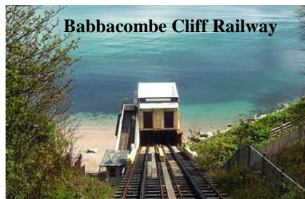
Babbacombe Cliff Railway

TLH LEISURE RESORT IS BEAUTIFULLY SITUATED FOR EASY ACCESS TO THE MANY DELIGHTS OF THE ENGLISH RIVIERA AND SOUTH-WESTERN DEVON. Besides many exciting resorts – Paignton, Brixham, Babbacombe, Dartmouth, Salcombe with its atmospheric yachting centre, Burgh Island where at high tide a tractor carries visitors to the island plus Plymouth with its famous history and outstanding attractions. Moving inland Buckfastleigh and Kent's Cavern will appeal whilst Dartmoor one of our outstanding National Parks demands a visit. The picturesque old English village of Cockington with its thatched cottages and 460 acres of beautiful country park – plus of course a traditional Devon Cream Tea!