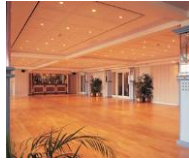
Riviera Lounge Carlton Hotel