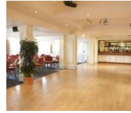
Chatsworth Lounge Toorak Hotel