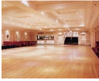
Warwick Ballroom Victoria Hotel

We have enjoyed over 42 years at TLH Leisure Resort – renowned for their outstanding facilities, service, comfort and of course excellent ballrooms.