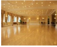
Richmond Ballroom Victoria Hotel