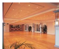
Riviera Lounge Carlton Hotel