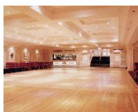
Warwick Ballroom Victoria Hotel

This We have enjoyed 40 years at TLH Leisure Resort – renowned for their outstanding facilities, service, comfort and of course excellent ballrooms.