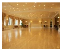
Richmond Ballroom Victoria Hotel