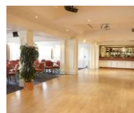
Chatsworth Lounge Toorak Hotel