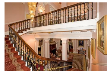
Newfield Hall in the Yorkshire Dales