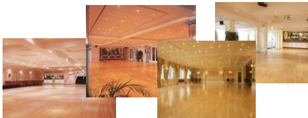
TLH Leisure Resort - Torquay 4 Superb Ballrooms

Experience the Pleasure of Watching The BEST in the WORLD in COMPETITION