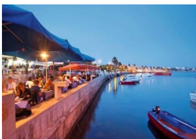
Paphos - Cyprus