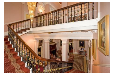
Newfield Hall in the Yorkshire Dales