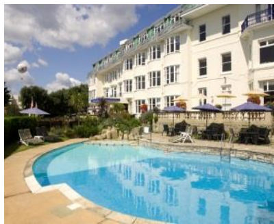
Marsham Court Hotel Bournemouth

Please see inside for our great range of good value and enjoyable dancing holidays