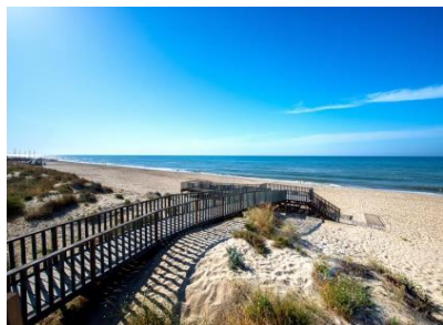
Huelva - Southern Spain