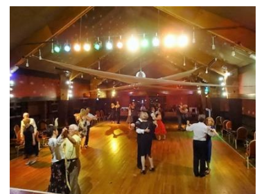
St. Audries Bay, Somerset