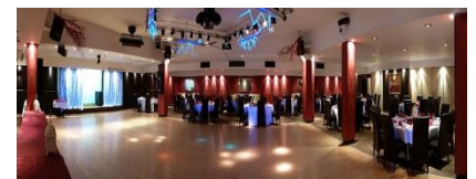
Inn on the Prom, St. Annes