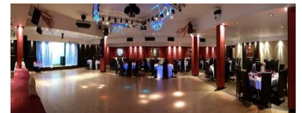
Inn on the Prom, St. Annes