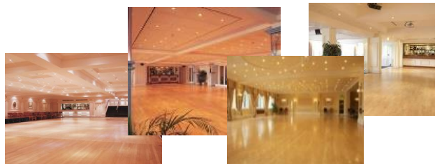
TLH Leisure Resort - Torquay 4 Superb Ballrooms