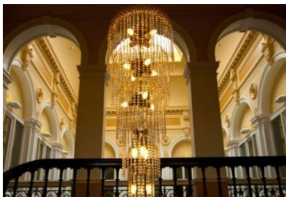
Newfield Hall in the Yorkshire Dales

Experience the Pleasure of Watching The BEST in the WORLD in COMPETITION