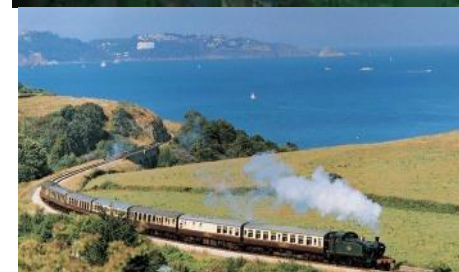
Paignton & Dartmouth Steam Railway

All rates are per person based on 2 people sharing a standard double or twin room to include breakfast and dinner plus full dance programme. Upgraded rooms may be available with a supplement. Book direct with TLH Leisure Resort