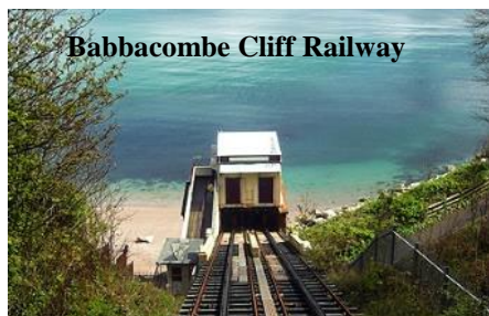
Babbacombe Cliff Railway