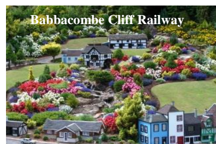
Babbacombe Cliff Railway

TLH LEISURE RESORT IS BEAUTIFULLY SITUATED FOR EASY ACCESS TO THE MANY DELIGHTS OF THE ENGLISH RIVIERA AND SOUTH-WESTERN DEVON. Besides many exciting resorts – Paignton, Brixham, Babbacombe, Dartmouth, Salcombe with its atmospheric yachting centre, Burgh Island where at high tide a tractor carries visitors to the island plus Plymouth with its famous history and outstanding attractions. Moving inland Buckfastleigh and Kent's Cavern will appeal whilst Dartmoor one of our outstanding National Parks demands a visit. The picturesque old English village of Cockington with its thatched cottages and 460 acres of beautiful country park – plus of course a traditional Devon Cream Tea!