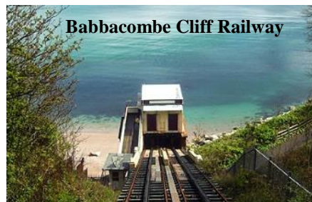
Babbacombe Cliff Railway

TLH LEISURE RESORT IS BEAUTIFULLY SITUATED FOR EASY ACCESS TO THE MANY DELIGHTS OF THE ENGLISH RIVIERA AND SOUTH-WESTERN DEVON. Besides many exciting resorts – Paignton, Brixham, Babbacombe, Dartmouth, Salcombe with its atmospheric yachting centre, Burgh Island where at high tide a tractor carries visitors to the island plus Plymouth with its famous history and outstanding attractions. Moving inland Buckfastleigh and Kent's Cavern will appeal whilst Dartmoor one of our outstanding National Parks demands a visit. The picturesque old English village of Cockington with its thatched cottages and 460 acres of beautiful country park – plus of course a traditional Devon Cream Tea!