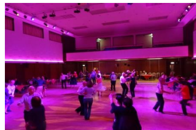
Dancing every Tuesday at Greenford, West London