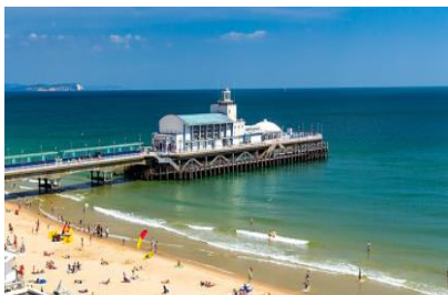
Bournemouth – 11 packages

EXPERIENCE THE PLEASURE OF WATCHING THE BEST IN THE WORLD IN COMPETITION 'LEARN TO DANCE' HOLIDAYS