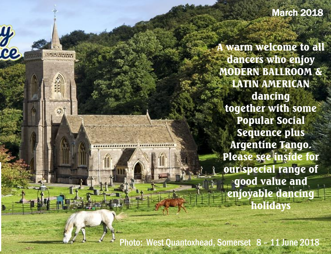
Photo: West Quantoxhead, Somerset 8 - 11 June 2018

Our holidays have been providing aching feet but happy hearts since 1981 Keep Dancing!