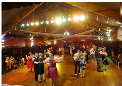
St. Audries Bay Somerset 8 - 11 June

SPECIAL PACKAGES FOR SOLOS ARGENTINE TANGO PACKAGES FOR ALL EXCELLENT LIVE & RECORDED MUSIC TOP CLASS DEMONSTRATIONS GREAT FESTIVALS and MASTERCLASSES DELIGHTFUL CHRISTMAS AND NEW YEAR DANCE EVENTS & PACKAGES