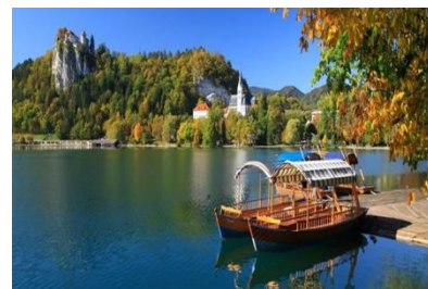
Slovenia 27 June – 4 July

ENJOY GREAT VENUES - HOME & OVERSEAS OUTSTANDING HOSTS and TEACHERS FRIENDLY LEARN & IMPROVE SESSIONS