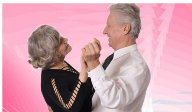
SOLOS February & October in Torquay April in St. Annes