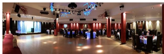
Inn on the Prom St. Annes: April / June / August