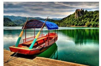
LAKE BLEED, SLOVENIA - July

ENJOY GREAT VENUES - HOME & OVERSEAS OUTSTANDING HOSTS and TEACHERS FRIENDLY LEARN & IMPROVE SESSIONS SPECIAL PACKAGES FOR SOLOS ARGENTINE TANGO PACKAGES FOR ALL EXCELLENT LIVE & RECORDED MUSIC TOP CLASS DEMONSTRATIONS GREAT FESTIVALS and MASTERCLASSES DELIGHTFUL CHRISTMAS AND NEW YEAR DANCE EVENTS & PACKAGES