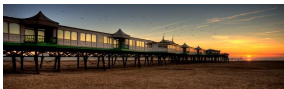
Inn on the Prom St. Annes: April / June / August / Nov