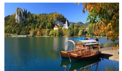
Slovenia 27 June – 4 July

PHILIP WYLIE, HOLIDAY & DANCE 73 Hoylake Crescent, Ickenham, Middx UB10 8JQ Tel: 01895 632143 Email: info@holidayanddance.co.uk