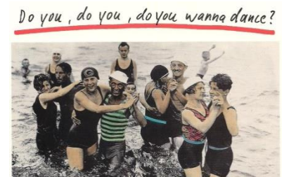
Do you, do you, do you wanna dance? LEARN TO DANCE 6 Weekend packages + 2 Overseas