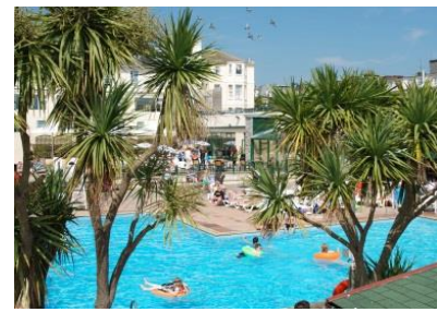
TLH Leisure Resort Torquay - 11 breaks

EXPERIENCE THE PLEASURE OF WATCHING THE BEST IN THE WORLD IN COMPETITION 'LEARN TO DANCE' HOLIDAYS