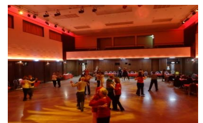
Dancing every Tuesday GREENFORD, West London