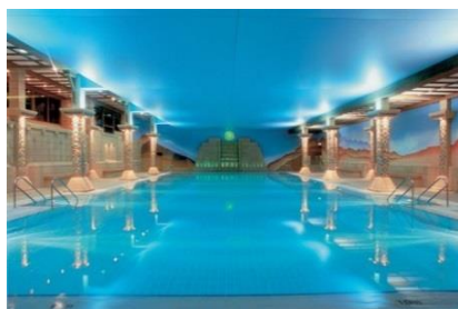
TLH Leisure Resort Torquay - 11 breaks

ARGENTINE TANGO PACKAGES FOR ALL EXCELLENT LIVE & RECORDED MUSIC TOP CLASS DEMONSTRATIONS GREAT FESTIVALS and MASTERCLASSES DELIGHTFUL CHRISTMAS AND NEW YEAR DANCE EVENTS & PACKAGES