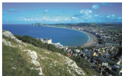
Llandudno 21 – 24 September

EXPERIENCE THE PLEASURE OF WATCHING THE BEST IN THE WORLD IN COMPETITION 'LEARN TO DANCE' HOLIDAYS