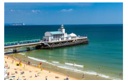
Bournemouth – 11 packages

ARGENTINE TANGO PACKAGES FOR ALL EXCELLENT LIVE & RECORDED MUSIC TOP CLASS DEMONSTRATIONS GREAT FESTIVALS and MASTERCLASSES DELIGHTFUL CHRISTMAS AND NEW YEAR DANCE EVENTS & PACKAGES