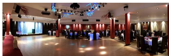
Inn on the Prom St. Annes: April / July / August

EXPERIENCE THE PLEASURE OF WATCHING THE BEST IN THE WORLD IN COMPETITION 'LEARN TO DANCE' HOLIDAYS