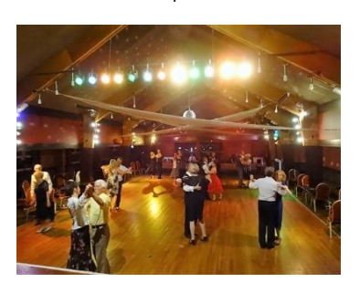
St. Audries Bay, Somerset Evening dancing for all Separate 'Learn to Dance' classes