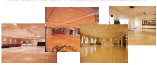
TLH Leisure Resort - Torquay 4 Superb Ballrooms