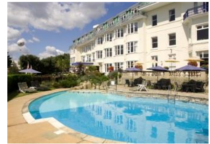
Marsham Court Hotel Bournemouth