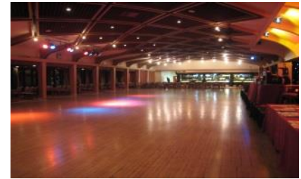
Ocean Ballroom Scarborough

ENJOY GREAT VENUES SPECIAL PACKAGES FOR SOLOS DANCE AT HOME AND OVERSEAS EXCELLENT LIVE & RECORDED MUSIC FRIENDLY LEARN & IMPROVE SESSIONS TOP CLASS DEMONSTRATIONS GREAT FESTIVALS and MASTERCLASSES DELIGHTFUL CHRISTMAS AND NEW YEAR DANCE EVENTS & PACKAGES ARGENTINE TANGO PACKAGES FOR ALL EXPERIENCE THE PLEASURE OF WATCHING THE BEST IN THE WORLD IN COMPETITION