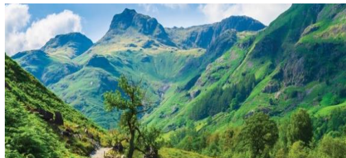
Learn to Dance in the Peak District